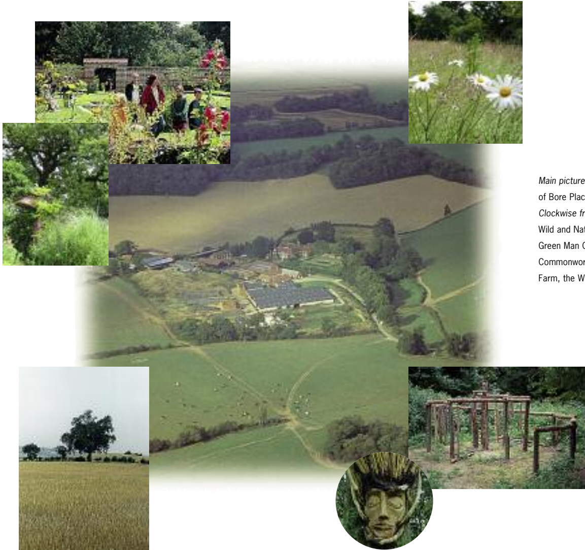
Main picture: aerial view of Bore Place. Clockwise from top right: Wild and Native Garden, Green Man Glade, Commonwork Organic Farm, the Walled Garden.

The gardens around the Centre offer a calm and refreshing space to meet and work. They had their heyday in the Jacobean period when both the manor house and gardens were very extensive, planned and formal. Now our garden plans reflect our interest in the interdependence of people and the natural world. They are managed organically and include permaculture and wildlife gardens.