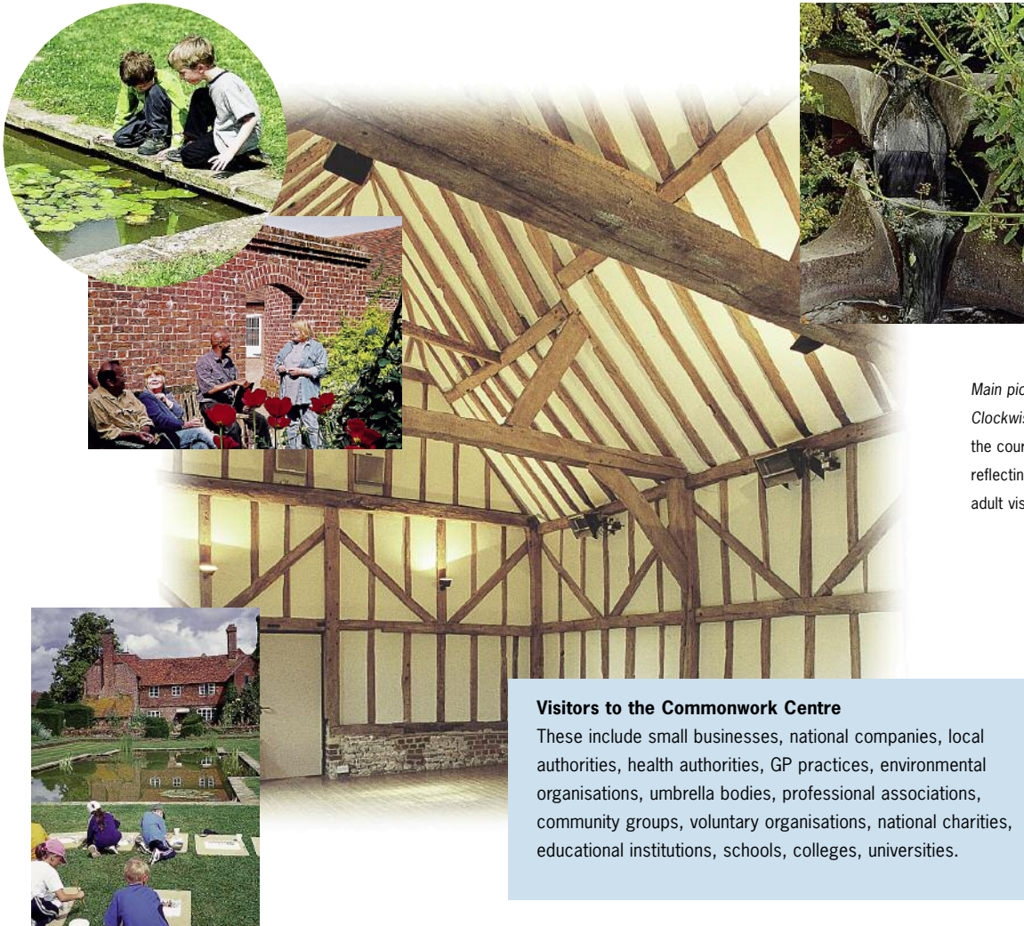
Main picture: the Large Barn. Clockwise from top right: the courtyard flowform, the reflecting pool, young and adult visitors at work.

The Centre offers space, time and resources for resident and non-resident groups to join Commonwork projects or to develop their own work. We aim to provide a nurturing and stimulating environment, in which you can feel 'at home' and use your stay creatively.