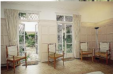
Bore Place House Main picture: the Walled Garden. Clockwise from top right: drawing room, bedroom, kitchen, studio, winter.

Your group is welcome to arrange a Commonwork activity at Bore Place including: painting, claywork, breadmaking, milking, night walks, willow basketry, trees to tools.